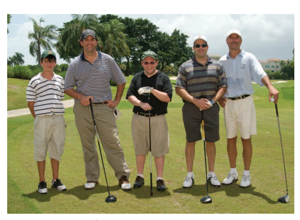
Pictured above: The winners of the tournament - Team Ischemia.

Anticipation is already building for the Sixth Annual SNIS Golf Tournament to be held on Tuesday, July 27 at the La Costa Resort & Spa in Carlsbad, California. Start practicing now...you could be our next winner!